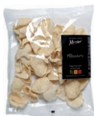
Poppadams Art. 2008 VPE 12 x 50g