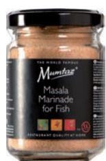
Masala Fish Marinade Art. 1996 VPE 6 x 95g