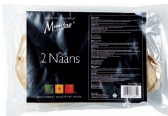
Plain Naan Art. 2006 VPE 8 x 260g