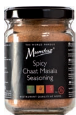
Chaat Masala Spice Mix Art. 1997 VPE 6 x 85g