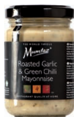
Roasted Garlic & Green Chilli Art. 2000 VPE 6 x 130g