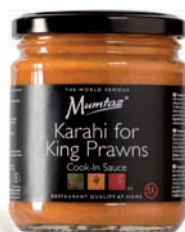
Karahi King Prawn Sauce Art. 1985 VPE 6 x 200g