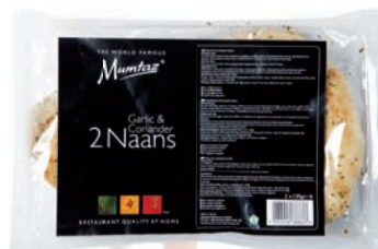
Garlic & Coriander Naan Art. 2007 VPE 6 x 260g