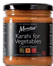
Karahi Vegetable Sauce Art. 1984 VPE 6 x 200g