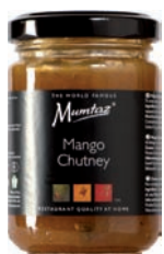
Mango Chutney Art. 1993 VPE 6 x 180g