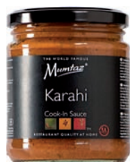
Karahi Sauce Art. 1983 VPE 6 x 200g