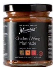
Chicken Wings Marinade Art. 1990 VPE 6 x 200g