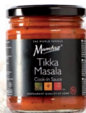
Tikka Masala Sauce Art. 1986 VPE 6 x 200g