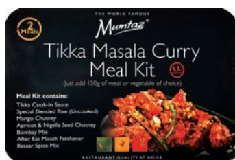
Tikka Meal Kit Art. 2011 VPE 6 x 576g