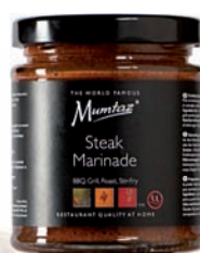
Steak Marinade Art. 1991 VPE 6 x 200g