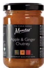
Apple & Ginger Chutney Art. 1994 VPE 6 x 180g