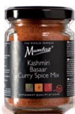
Kashmiri Basaar Curry Spice Mix Art. 1998 VPE 6 x 80g