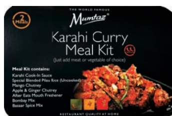
Karahi Meal Kit Art. 2012 VPE 6 x 576g