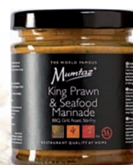
King Prawn & Sea Food Marinade Art. 1992 VPE 6 x 200g