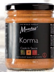
Korma Sauce Art. 1987 VPE 6 x 200g