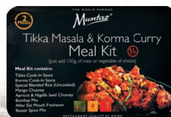
Tikka & Korma Meal Kit Art. 2013 VPE 6 x 576g