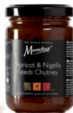
Apricot & Nigella Seed Chutney Art. 1995 VPE 6 x 180g