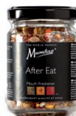
After Eats Mouth Refreshener Art. 2010 VPE 6 x 85g