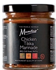
Chicken Tikka Marinade Art. 1988 VPE 6 x 200g