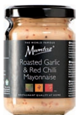
Roasted Garlic & Red Chilli Art. 1999 VPE 6 x 130g