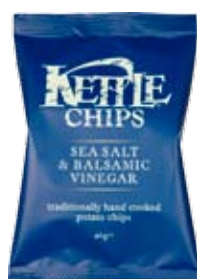
Sea Salt & Balsamic Vinegar