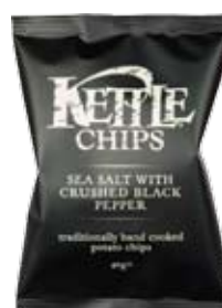
Sea Salt & Crushed Black Pepper